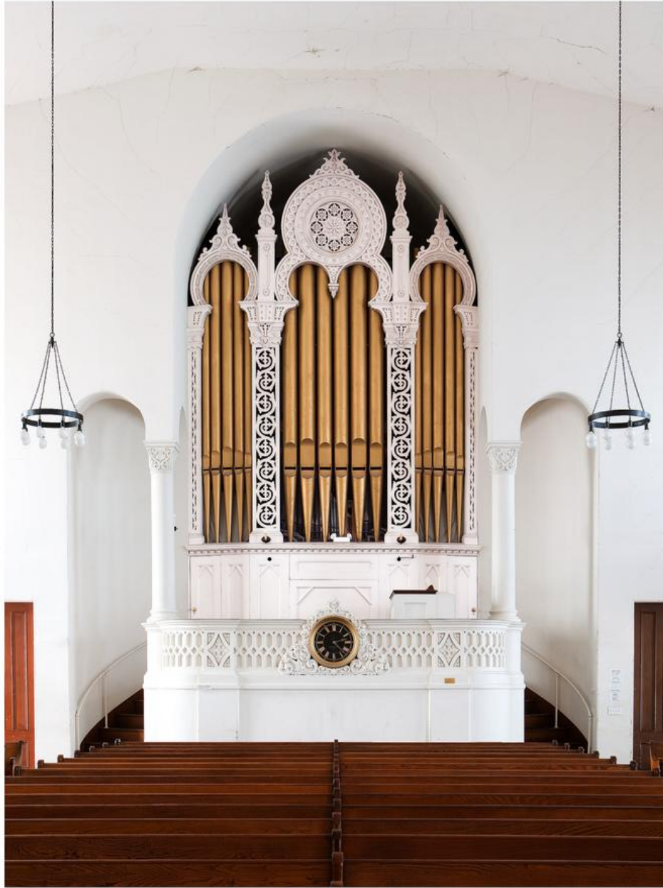
BELLEVILLE CONGREGATIONAL CHURCH NEWBURYPORT, MASSACHUSETTS